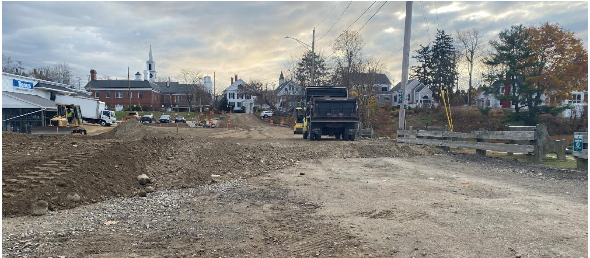
Figure 1: Raising the grade of the parking lot.