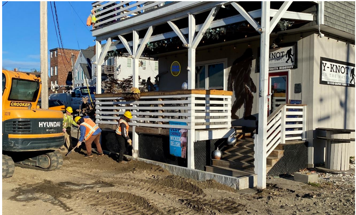
Figure 2: Crew members work to install granite curbing in front of Y-Knot to prepare for the grade change that is occurring. This will allow water to flow to the new stormdrain in Taco Alley.